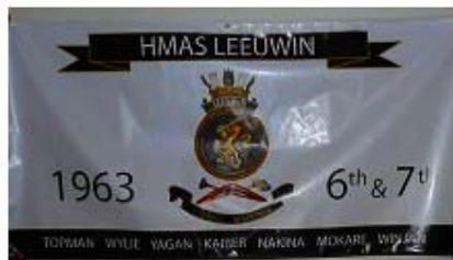
1963 Banner

A number of intake groups have gone to a lot of trouble to make banners to be shown on the day to identify their intake. These banners will also serve as a rallying point for the various intakes and will offer an important photo opportunity and also add to the festivities of the day. For those contemplating making a banner our suggestion is not to try and make it too large. Remember there will be people sitting behind you on the day and we do not wish that they obstruct the view of others attending.