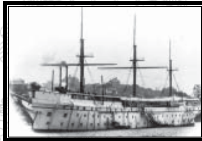
HMAS Tingira in Rose Bay.

just one trip each year out to Sydney. She usually completed the voyage in about 70 days. For nearly a quarter of a century Sobraon transported gold-seekers and settlers out to the colonies, returning to London with a cargo of wool bales and wheat. One of the finest of paintings coveted by lovers of sailing ships depicts Sobraon loading wool at Circular Quay in 1871 on that section of the old quay now dominated by the overseas terminal. In 1891, just 10 years before Federation, Sobraon was sold to the Government of New South Wales.